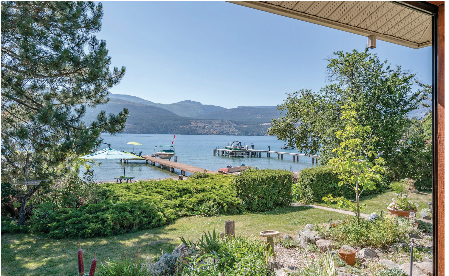
15714 WHISKEY COVE RD, Lake Country BC